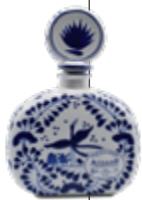
AZULEJOS Talavera Añejo