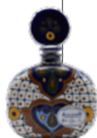
AZULEJOS Talavera Añejo

Housed in hand-painted clay bottles by Mexican artisans in Puebla, Mexico. Produced in the heart of Tequila Jalisco, using only 100% Blue Agave that is roasted in an autoclave oven (pressure cooker style), shredded with a roller mill and aged in Ex-Burbon barrels for 18 months.