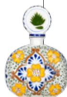
AZULEJOS Talavera Añejo