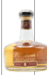
SIETE LEGUAS D' Antaño